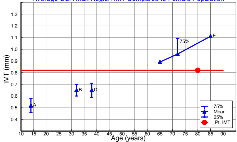
Average CCA Max Region IMT Compared to Female Population