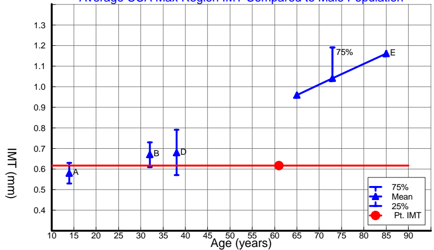
Average CCA Max Region IMT Compared to Male Population