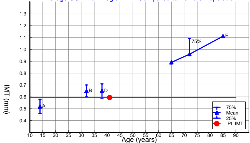
Average CCA Max Region IMT Compared to Female Population