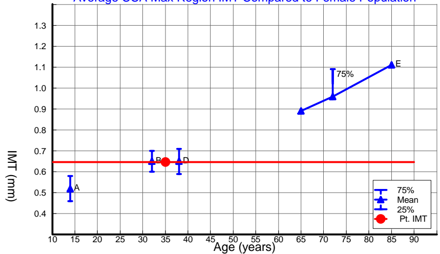
Average CCA Max Region IMT Compared to Female Population