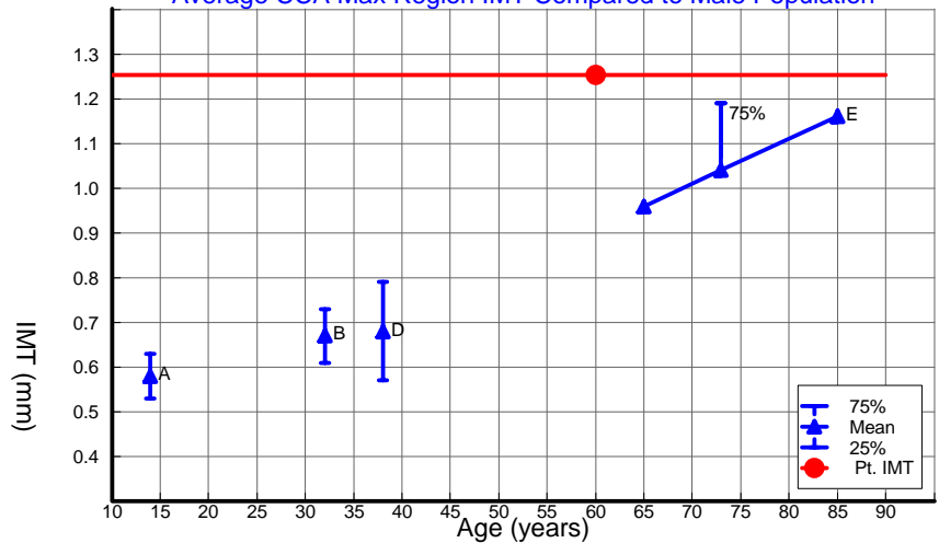
Average CCA Max Region IMT Compared to Male Population