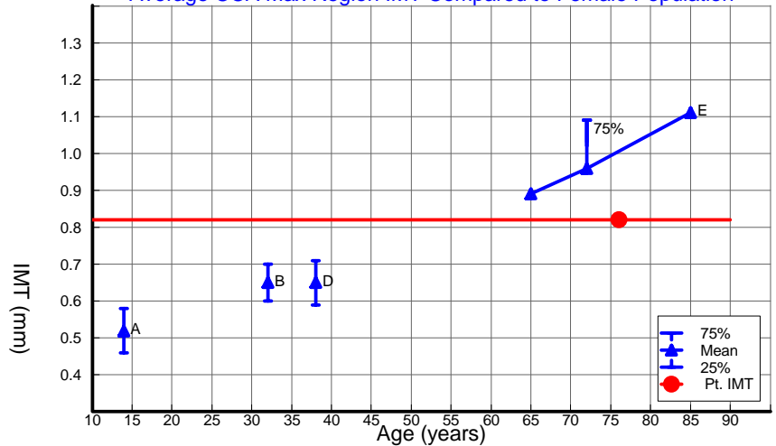
Average CCA Max Region IMT Compared to Female Population