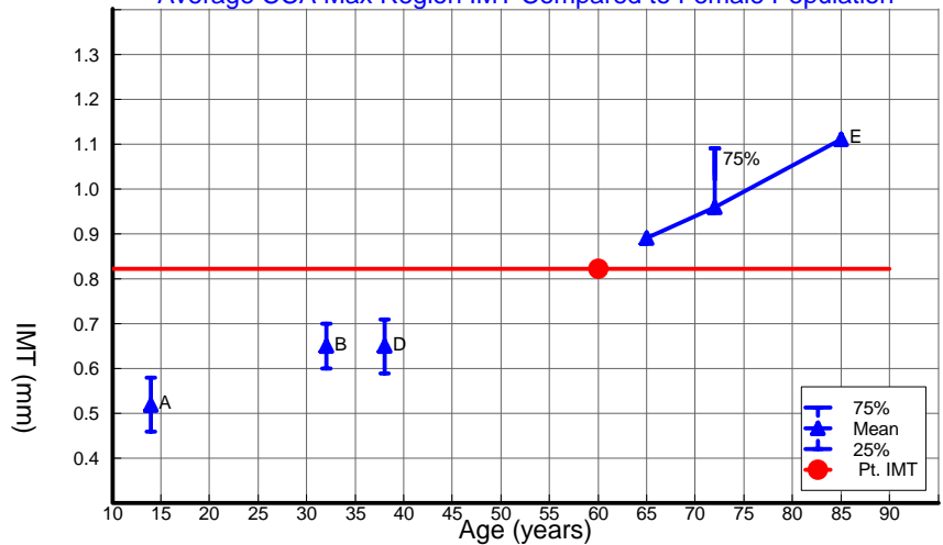
Average CCA Max Region IMT Compared to Female Population