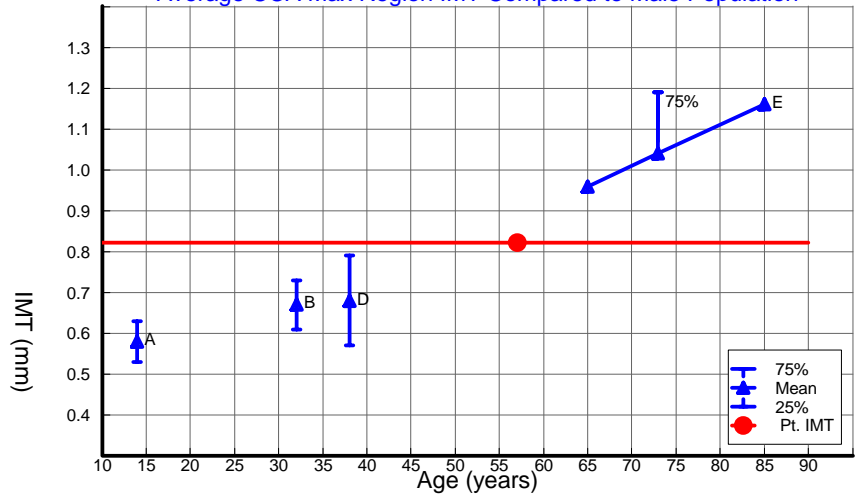
Average CCA Max Region IMT Compared to Male Population