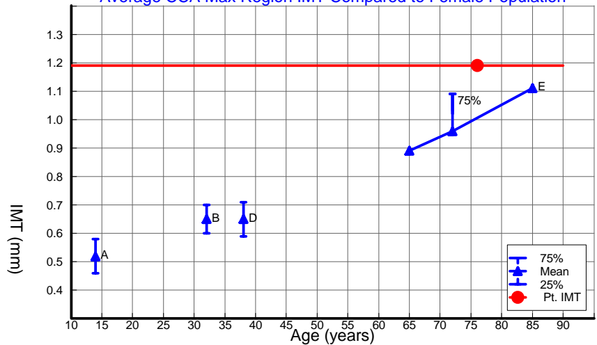
Average CCA Max Region IMT Compared to Female Population