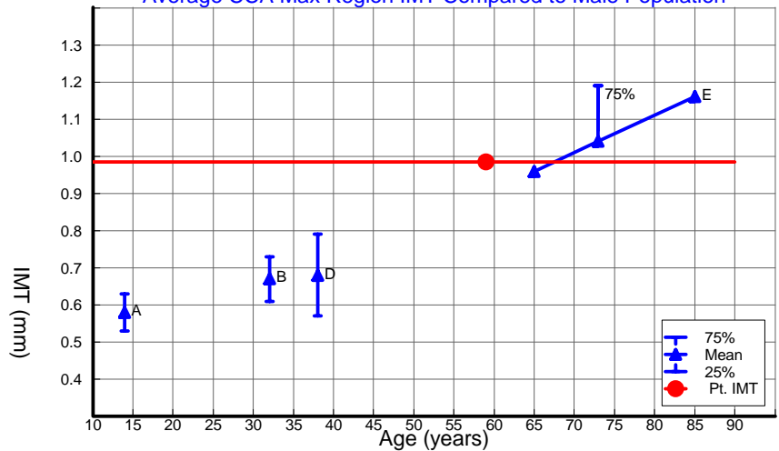
Average CCA Max Region IMT Compared to Male Population