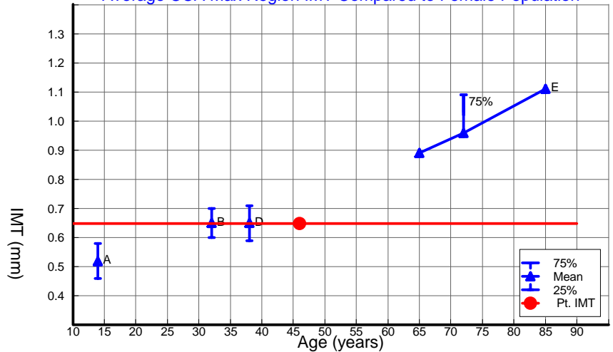
Average CCA Max Region IMT Compared to Female Population