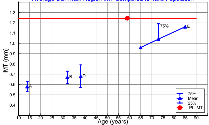
Average CCA Max Region IMT Compared to Male Population