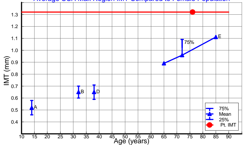
Average CCA Max Region IMT Compared to Female Population