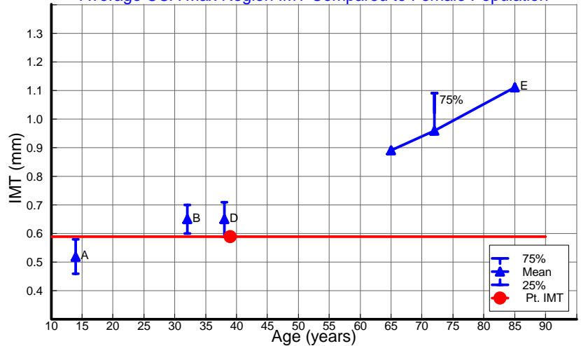
Average CCA Max Region IMT Compared to Female Population