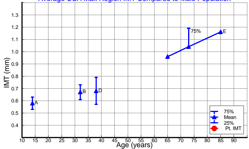
Average CCA Max Region IMT Compared to Male Population