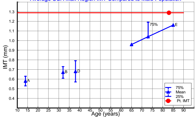
Average CCA Max Region IMT Compared to Male Population