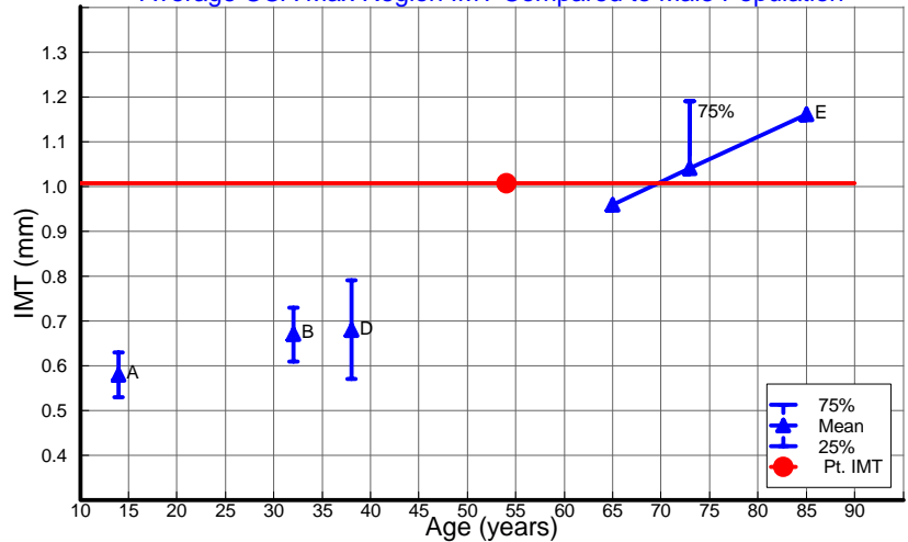
Average CCA Max Region IMT Compared to Male Population