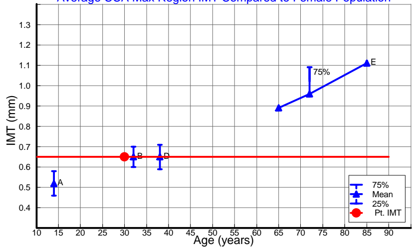
Average CCA Max Region IMT Compared to Female Population