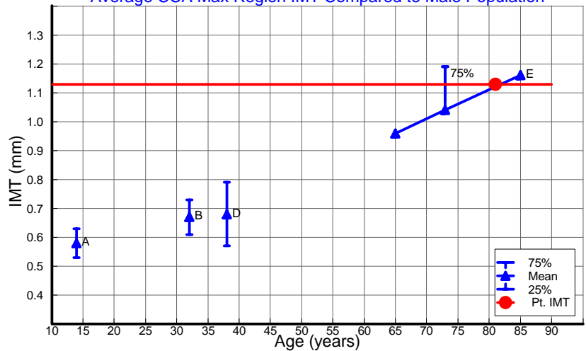
Average CCA Max Region IMT Compared to Male Population