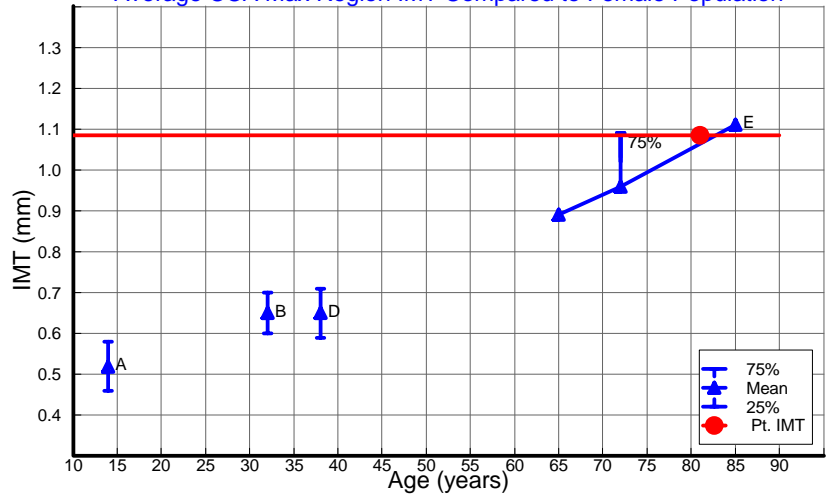
Average CCA Max Region IMT Compared to Female Population